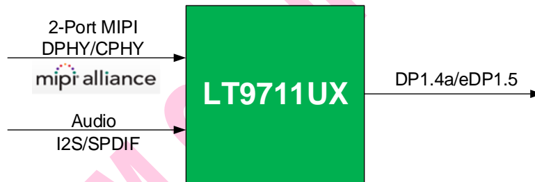
Figure 3.1 Application Diagram